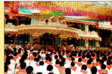
World Youth Conference - 6000 youth from 85 countries

China and community service also started.