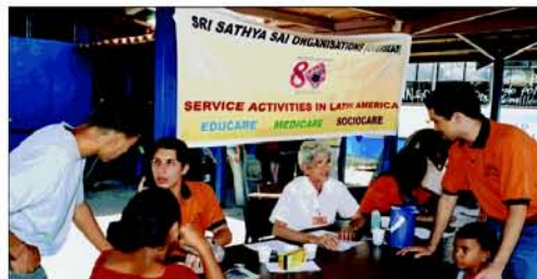
Permanent medical camps are run in 7 Latin American countries

Baba says, "Let all the faiths exist; let them flourish and let the glory of God be sung in all languages and in a variety of tunes..." As a result of Baba's secular outlook Prashanti Nilayam has become the pilgrimage destination of the world. From Iranians who come to celebrate the holy month of Ramadan in Baba's presence, to the Christians who converge at Prashanti Nilayam for Christmas, a