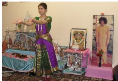
Entertainment and refreshments for the Elderly in Brent