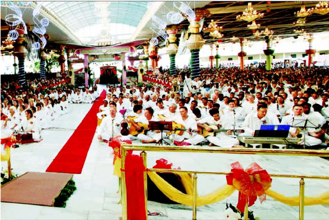
are a regular feature in Prashanti Nilayam's multi-faith calendar which also includes the celebration of Hindu, Buddhist, Jewish &amp; Muslim festivals