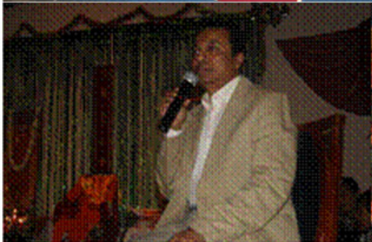
85th Baba's Birthday Celebration @ Farnborough Centre