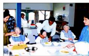
Feeding the elderly at Seniors' homes is a regular Sai service activity

Sai volunteers worked round the clock to provide relief and rehabilitation to the victims of the massive earthquake that struck the Republic of Haiti on 12th January 2010. Between 19th January and August 2010, under the guidance of Baba, they provided free medical treatment to over 34,000 people, served more than 150,000 hot meals, supplied thousands of gallons of potable water, built homes and cleaned roads for Haitians. The work that began seven days after the earthquake in the midst of widespread destruction continues to this day with the discipline, determination and dedication that has become the hallmark of Sai volunteers.