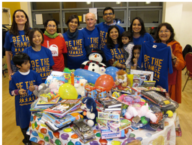
Toy collection for Heart FM Appeal