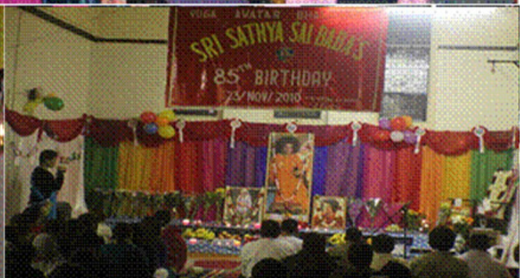
↑ The new Reading Lotus Centre. 85th B'day Celebration ← A Massive Turnout of 300 People. @ Farnborough Centre