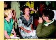
Sai medical camps serve many afflicted by the war in former Yugoslavia.

1990 Sai Foundation of El Salvador swung into full service mode, rebuilding a Catholic church and providing disaster relief in the aftermath of an earthquake. The movement became even more