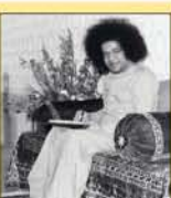
Scripting the saga of Love for posterity