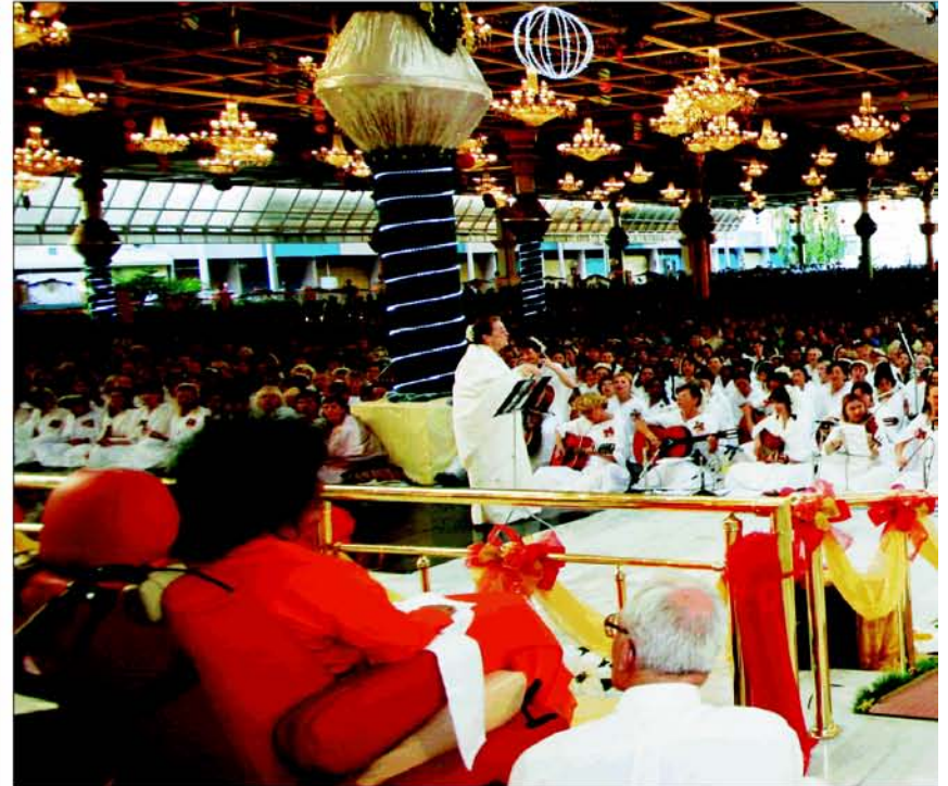
Baba says, "Let all the faiths exist; let them flourish and let the glory of God be sung in all languages and in a variety of tunes..." Christmas festival: