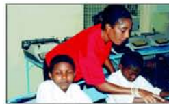
Be it teaching braille to visually impaired children or distributing blankets in Africa, the warmth of Sai love touches hearts every day across the globe

SEAMEO and UN-HABITAT have declared the Sathya Sai School in Thailand as a 'Centre of Excellence'. Upon the request of the Ministry of Education, Thailand, over 20,000 teachers in the country have received training here. The school also trains educators from different parts of the world in "Human Values-Based World Education". This unique program based on Baba's teachings has been adopted by the United